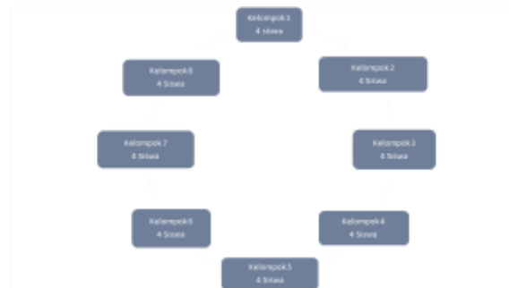
Figure 1. The first pattern of using the two stay two stray learning strategy

Students at this stage discuss the material that has been shared. Then group members are tasked with solving problems in the form of answering questions. The answers to the questions become points that are shared with "two guests" from the other group. The discussion lasted for 20 minutes. After discussion, each group divides tasks between those who are "guests" and those who are members who "stay in their places" as shown in Figure 2.