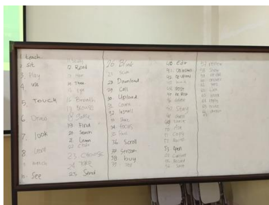
Figure 4. Elicited Verbs in PWIM

In the descriptive analysis, in the qualitative analysis, the results expressed the respondents' excitement in the process of learning. Most respondents were excitedly challenged to be actively engaged in the learning process, eliciting verbs as many as they could, and developing the verbs in the structured sentences based on the tenses' discussion. The following Figure 4 shows the elicited verbs through PWIM.