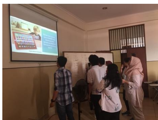
Figure 3. Respondents' Excitement in PWIM

of intervention were implemented in the PWIM group. The results showed an increasing achievement from the first cycle to the second cycle. In the first cycle, a poster picture of the educational theme was displayed. In 15 minutes, the respondents successfully elicited 75 verbs and generated 43 structured sentences from the verbs in 30 minutes. From the sentences, there were 39 simple structured sentences and 4 compound structured sentences developed. In the next cycle, a political theme of the poster picture was displayed. The poster picture helped the respondents to elicit 50 verbs in 15 minutes and develop 43 structured sentences in 30 minutes. The sentences consisted of 41 simple structured sentences and 2 compound structured sentences. In PWIM, selecting a picture plays a vital role in assisting the respondents in generating words and sentences. Therefore, the selected picture applied in the first cycle, and the second cycle influenced the respondents' difficulty eliciting the verbs. The data yielded the number of the verbs were declining from the first to the second. Though, the excitement of the respondents' engagement was clearly expressed during the process of the intervention. The respondents were excited to elicit the verbs as many as they could and challenged to be the first to find out every verb. Figure 3 showed the expression of the respondents' excitement and achievement.