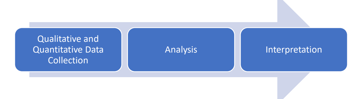
Figure 1. Research Design.

By employing both qualitative and quantitative data collection methods, the study aimed to provide a nuanced and comprehensive analysis of the issues pertaining to the targeted age group within the specified community.