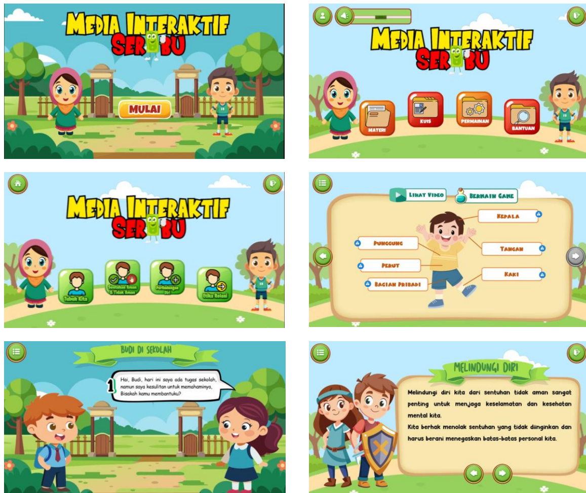
Figure 2. Stages of Design and Development of the SERIBU Application

In the initial stage, namely analysis, researchers conducted a preliminary study in several elementary schools in Serang City to find out the problems and needs of both teachers and students, as well as analyzing the appropriate type of media to use to solve these problems. Furthermore, at the design stage, after conducting analysis, it was found that the appropriate and frequently used media was application media. This stage continues with the design and development of an application that presents information about sexual education through text, animated videos and interesting quizzes to test students' understanding of the material presented.