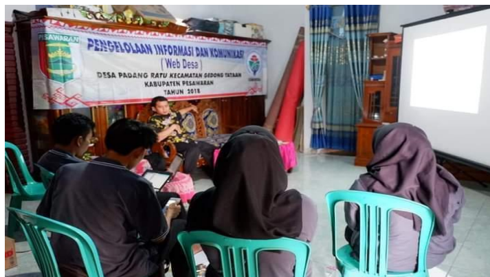
Figure 2. Visit Activities of the Pesawaran District Communication and Informatics Office

that is carried out at the Pesawaran District Communication and Informatics Service Office. This activity is also intended to motivate village website operators to manage village websites, villagers to contribute to providing village website content, and village government officials to understand the importance of village websites for village development, to fully support village website management.