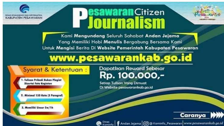
Figure 1. E-flyer for Online News Writing Competition