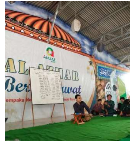
Figure SEQ Figure \* ARABIC 1: learning activities in the

The planning management applied at this institution includes types of planning from the time dimension and the level dimension of planning techniques. Each program and the learning outcomes offered are different but are still classified as short term, namely divided into 3 periods, two week programs, one month and holidays. Meanwhile, from the level of planning techniques, the program is tailored to the needs and abilities of students. Learning is led by a tutor who has been scheduled, the time has been determined, and the learning method adapts to the lesson to be delivered.