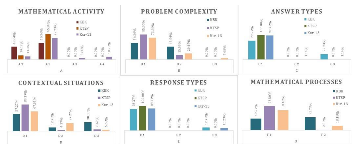
Picture 1. Diagram and Percentage Research Result