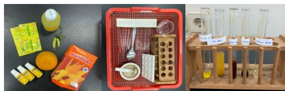
Figure 2. Trial Stage Process

worksheet so that it is necessary to reconstruct the worksheet, especially the absence of practicum objectives as the most important part of a worksheet which will determine the expected achievements of students. An important principle that should be present in the worksheet is the objective (Nasution & Hafizah, 2020); (Utami et al., 2020).