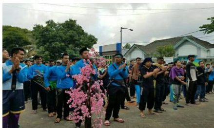
Figure 4. Activity of Shabah al- Lughah

This psychological theory is also supported by the learning theory which said that the diversity of strategies and methods used in a lesson will provide more motivation to students and will encourage the creation of fun and enjoyable learning 26 . Environmental factors have an influence on the language productive abilities of students 27 . Some of these factors can be seen in shabah al-lughah joyful atmosphere which can be seen in Figure 4 below: