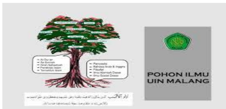
Figure 2. Construction of Scientific Integration

Curriculum development in UIN Maulana Malik Ibrahim Malang is based on integration. Integration between science and religion, curriculum construction is " pohon ilmu " (tree of knowledge"). See figure 3 below: