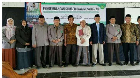
Figure 5. Council of Kyai (Clerics) in Ma'had al-Jami'ah with the Fourth Vice Chancellor

The musyrif and musyrifah are always provided with training and workshops once a semester to improve their competence. As in Figure 5 below: