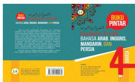
Figure 3. Teaching Material for Human Resources Development Training

The development of Arabic programs is not only for students, but also for Arabic teaching staff (lecturers) and education staff (employees) in the form of training twice a week. The human resource development program is training for educators and education staff in all faculties, guided by Arabic and English lecturers at the Language Development Center (P2B) unit to practice their language skills, the competency for educators is also important to be improved 19 . One of the objectives of the foreign language program is to improve foreign language skills for all educators and education staff so that they are able to help the students optimally 20 . The following figure is material used in the training: