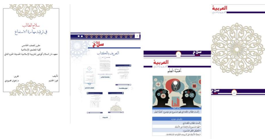
Figure. 2 The Textbook as the Learning Materials of Listening Skills

Figure 2, a number of the pages are 107 pages, including the covers and there are 15 topics included in these teaching modules. There are four components to each subject: Inner cover: the title of the unit, illustrated image, general objective, and particular objectives. Main text in the disk: a text for students to listen to. New vocabulary: The audiovisual text vocabulary, by giving meaning, explains the pupils' understanding. Phrases: They contain types of phrases found in audio texts with the meanings indicated therein. Trainings: There are types of training to determine the students understanding of the audible and summarize the audio text and the vocabulary used therein. Vocabulary and phrases, this book vocabulary offers new terms and expressions found in audiovisual materials. The meanings, phrases, and explanations are given in Arabic and a picture. Training and Questions, the training in this book differs depending on its goal of listening skill development in design. The following are these exercises, expression exercises, and vocabulary exercises.