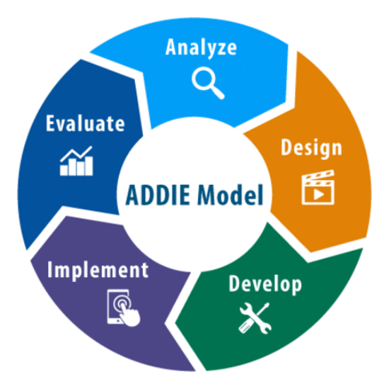
Figure 1. The ADDIE Development Model

In the analysis stage, the researchers analyzed the urgency, feasibility, and requirements for developing a digital module based on self-regulated learning in basic mathematics courses. Needs analysis includes student characteristics, background and conditions, subject matter, and relevant sources to be used as the basis for developing a digital module. At the design stage, the researcher prepares a plan for doing a digital module that begins with developing a framework for making the digital module. This conceptual framework is used as a reference in preparing the digital module. In the development stage, the researcher develops a digital module based on the framework made in the previous stage. At the implementation stage, the researchers carried out validation and feasibility testing of the digital module that had been developed. The trial was carried out on 239 students. In the final stage, the researchers analyzed the trial's results to determine its effectiveness on students taking basic mathematics courses.