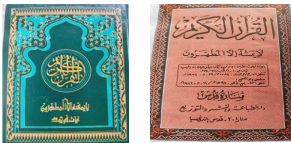
Figure 2. The Mushaf Pojok Menara Kudus 1974

The illuminated cover of the Menara Kudus features calligraphy in gold ink that says [القران الكريم] and a verse of QS. Waqi'ah : 79 [لا يَمَسُّهُ إِلَّا الْمُطَهَّرُونَ]. The frame on this sheet is a single framed design. The outside layer is framed by triangular squares interlaced in a green-beige floral pattern. At the same time, the center features an image of a prayer mat with a boldly printed circle containing calligraphic text in khat riq'ah . There is a publisher's note from Menara Kudus Printing in Indonesia.