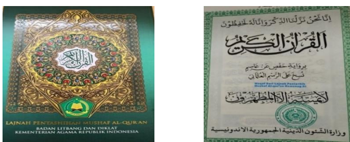
Figure 1. The Indonesian Usmani Standard Mushaf

The number of Qur'an verses in the Indonesian Standard Mushaf (MSI), 6.236 verses in total, is based on the mazhab al-Kuffiyyūn narrated by Hamzah bin Hubaib bin Ziyat from Ibn Abu Laila from Abu Abdirrahman bin Habib as-Sulami from Ali bin Abi Talib. The MSI cover contains an inner cover page, the illumination of Surah al-Baqarah, tashih markings, ta'rif mushaf, dabt , waqaf marking explanation, and khotmil Qur'an prayer.