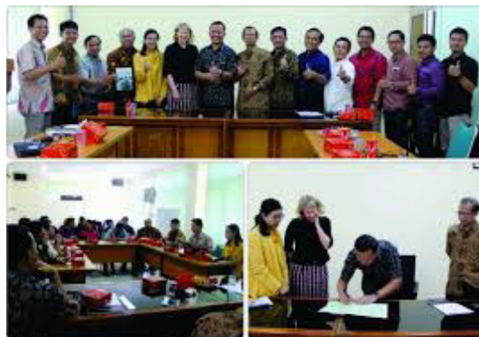
Figure 2: AIPJ-PTKIN Collaboration for University Legal Clinic Development