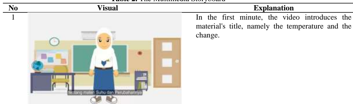
Table 2. The Multimedia Storyboard

In Table 2 describes the content of flipped classroom-based physics learning animation videos. There is a physics animation explaining the concept of temperature and its changes. This animated video aims to be a learning resource for students independently.