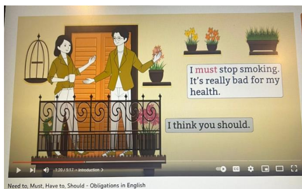
Figure 1. Youtube Video

Educational institutions can use YouTube videos as a teaching medium that students prefer. Students more easily understand the information in the form of knowledge through media related to information technology, such as YouTube, compared to conventional delivery in class.