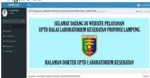
Figure 11. Doctor's Main

Page Doctor's main page after logging in. The doctor's home display can be seen in Figure 11