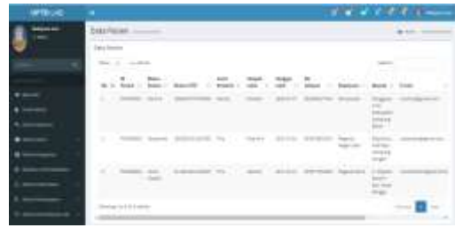
Figure 7. Patient Data Management

management page is used to manage patient data. The display of patient data management can be seen in Figure 7