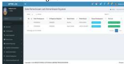
Figure 9. Lab Examination Management

Page Page for administrative staff to view patient lab examination data. The display of the manage lab examination page can be seen in Figure 9.