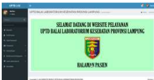
Figure 12. Patient Main

Main Page Patient's main page after logging in. The patient's main page display can be seen in Figure 12.