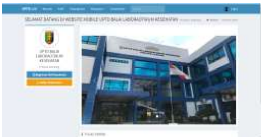
Figure 5 Main Page.

the image below is the main page of the system. The index/main page display can be seen in Figure 5.