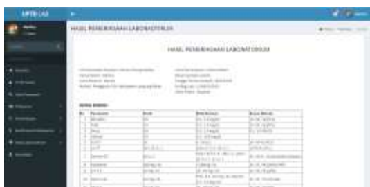
Figure 13. Inspection Results Page

Page Page for patients to print examination results. The display of the inspection results can be seen in Figure 13.