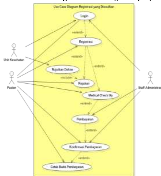
Figure 2. Use Case Registration Diagram

Building Prototyping by making the proposed system design focus on the objects or actors involved, by making input and output formats including registration, inspection and consultation using Use Case Diagrams[10]