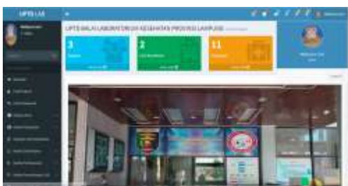
Figure 6 Administration Staff

staff page after login. The appearance of the administration staff home can be seen in Figure 6