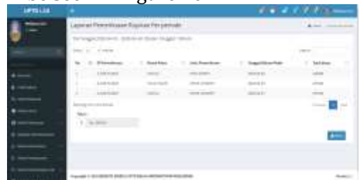
Figure 10. Lab results report

Page Page for administrative staff to manage patient lab result data. The display of the lab results reports page can be seen in Figure 10.