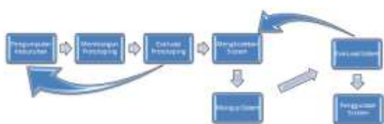
Model Prototype .

The problem-solving approach used in this study is the Prototype [8]. This methodology has several important steps that must be carried out in the Implementation of the Application of the Prototyping in the Health Laboratory Service Information System. Based UPTD Lampung Provincial Health Laboratory Center Mobile . The process stages that will be used include the following: