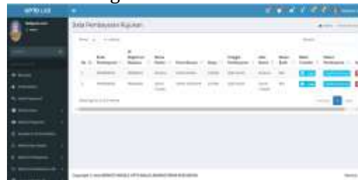
Figure 8. Payment Data Management

Page Page for administrative staff to manage patient payment data. The display of managing payment data can be seen in Figure 8.