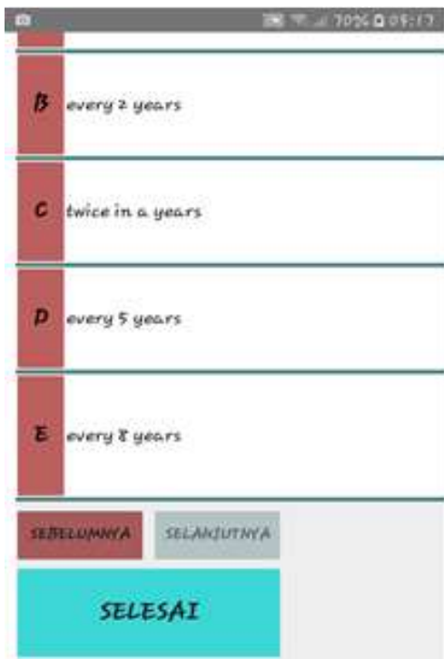
Figure 8. Display of the page finished taking the exam