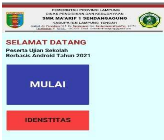
Figure 2. Main page view