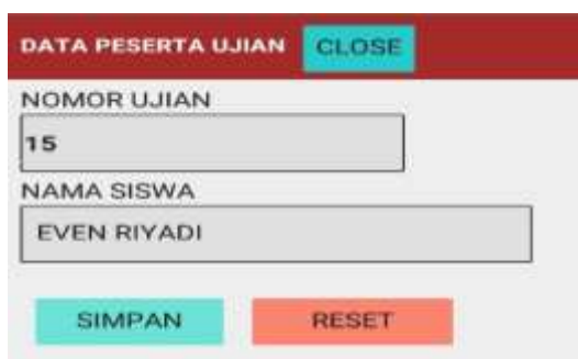
Figure 4. Display of the identity input page