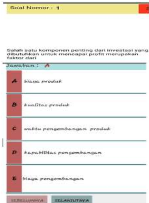
Figure 7. Display of exam questions and answer choices