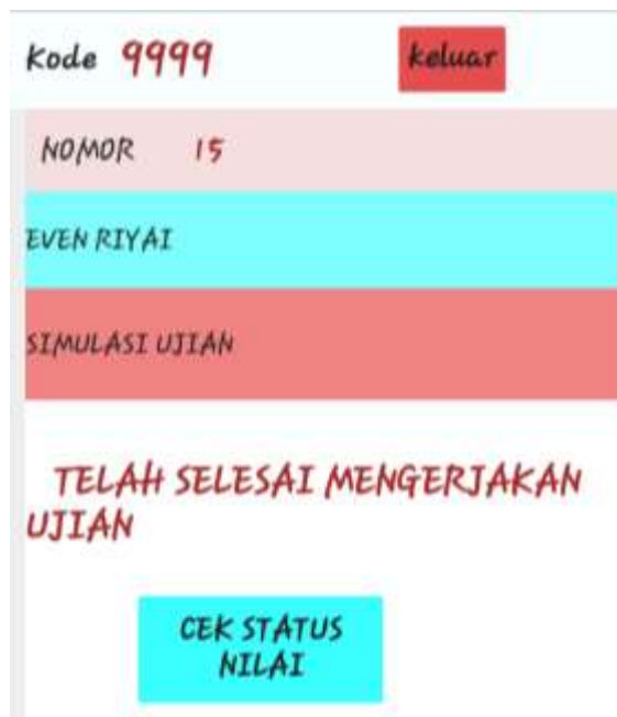
Figure 9. Display of value status check page

This research aims to design an Android-based exam application system to make it easier for teachers and students to take grades on students. The use of this technology also aims to make Ma'arif 1 Sendangagung Vocational School more advanced with the application of Android technology. The stages of the research method are first data collection, second data analysis, third application design, and fourth result report. The results of this study are an Android School Examination Application at Maarif 1 Sendangagung Vocational School. The application was built using Delphi EMBARCADERO, Android SDK (Software Development Kit), Android Developer Tools (ADT), and Android Operating System: Froyo 2.2 with Google API SDK 25.2.5, Java, XML. This School Exam Android application can save time in the process of assessing student exam results and make it easier to check student scores.