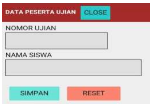
Figure 3. Identity menu display