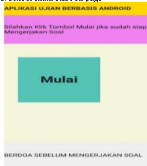
Figure 6. Display of exam start page