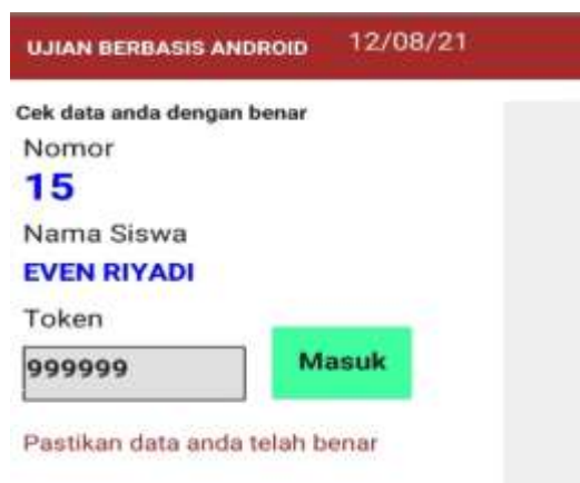
Figure 5. Display of exam token input page