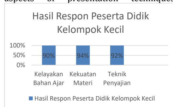
Figure 4.10 Small Group Student Response Results

Small Group Trial This small group trial was conducted on a limited number of students, the student trial was conducted on 15 students from three schools in class XI MIPA where data collection using a questionnaire was carried out offline. The questionnaire used includes several aspects, namely the feasibility of teaching materials, aspects of material strength, and aspects of presentation techniques.